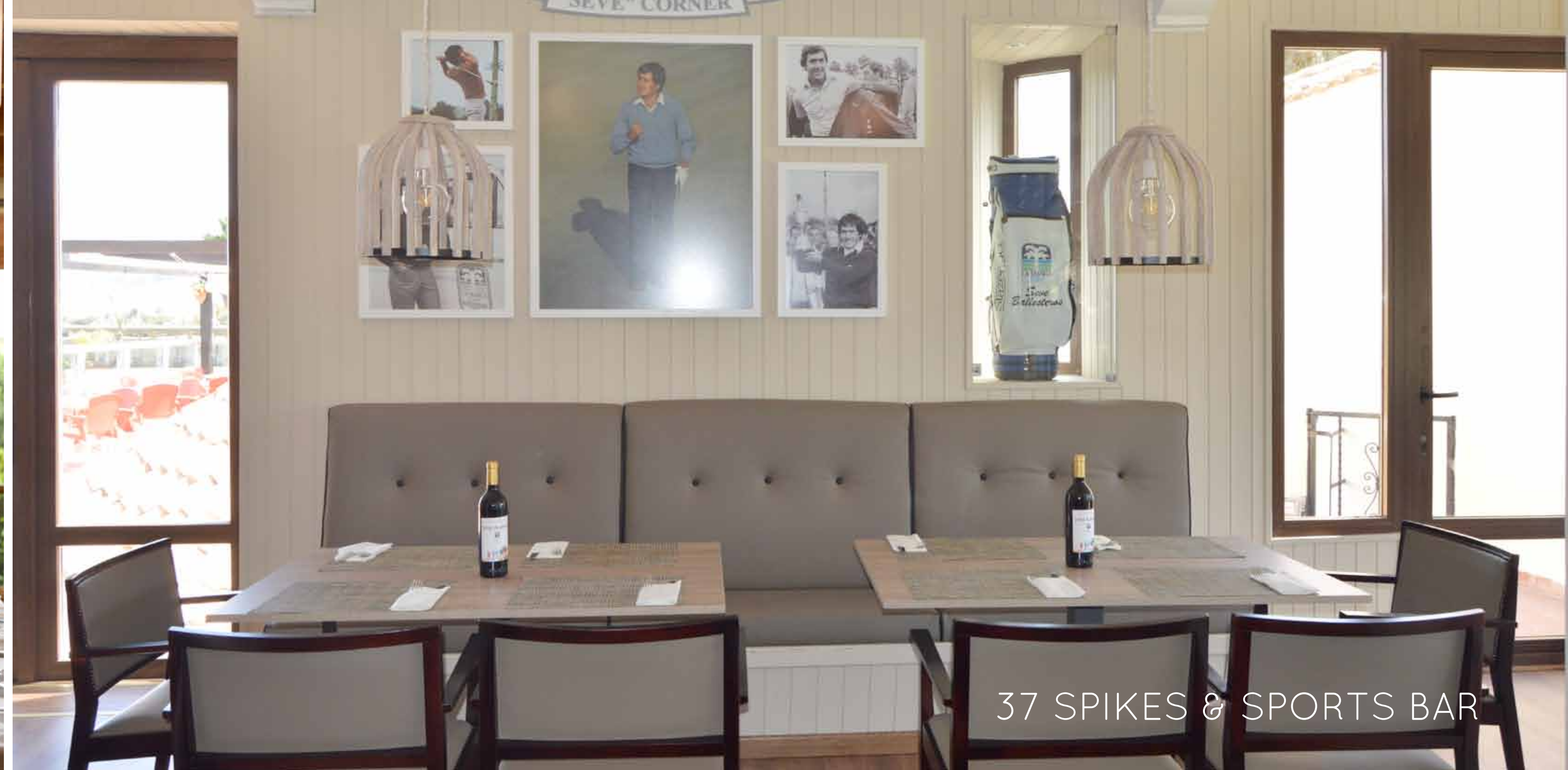
37 SPIKES & SPORTS BAR