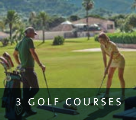
3 GOLF COURSES