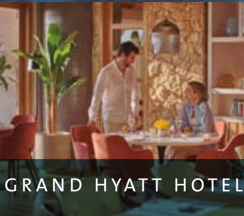
GRAND HYATT HOTEL